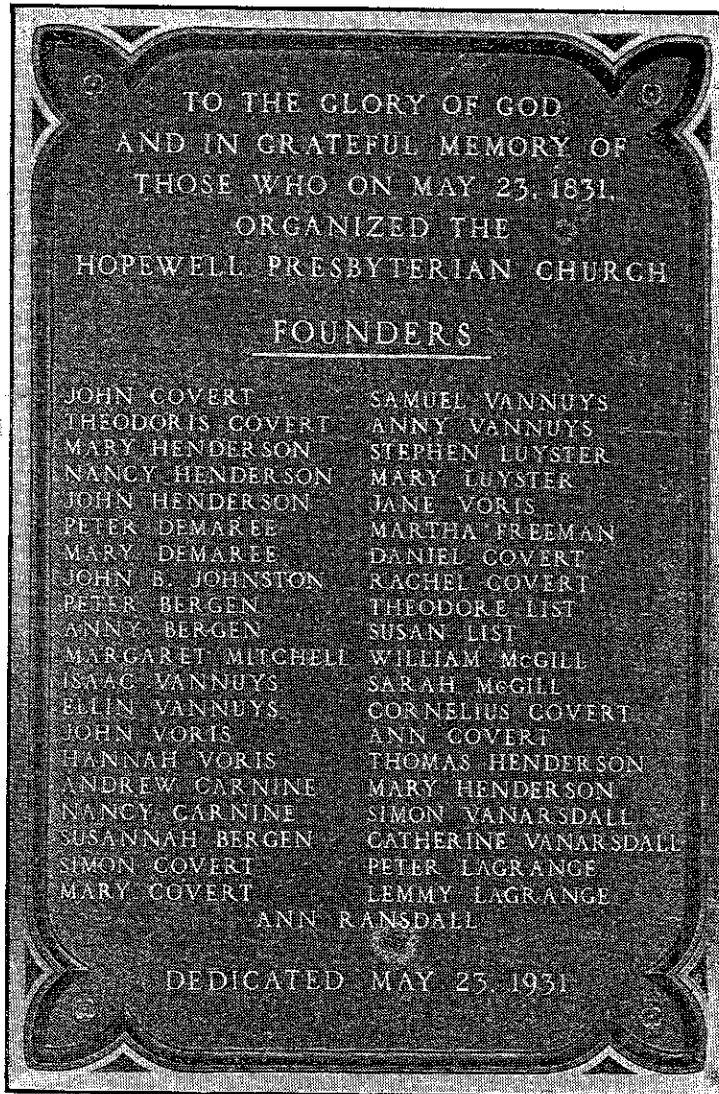
Bronze tablet on Mud Meeting House pulpit now in Hopewell Presbyterian Church near Franklin, Indiana. Pulpit was moved there by Hopewell members several years ago, subject to call for return at any time by Mud Meeting House trustees.